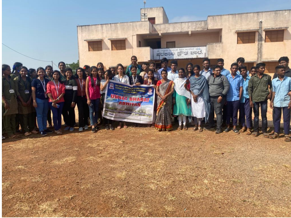
Interactions with students at Yerikoppa Village