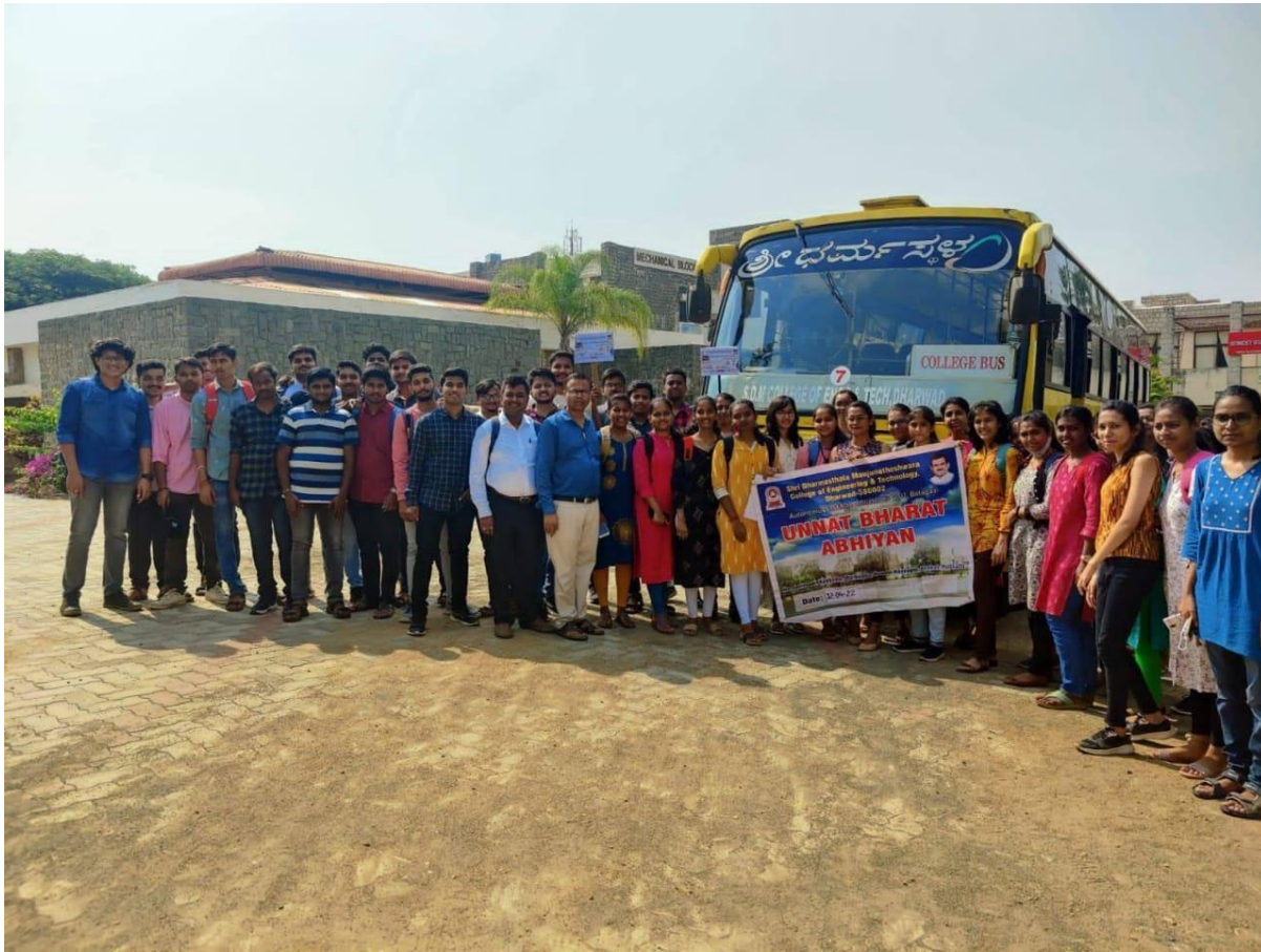
Fig 2: SDMCET, Dharwad