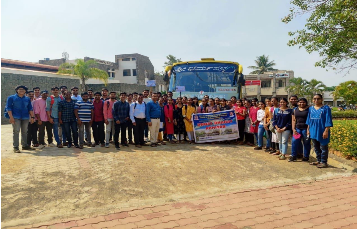
Fig 1: SDMCET, Dharwad