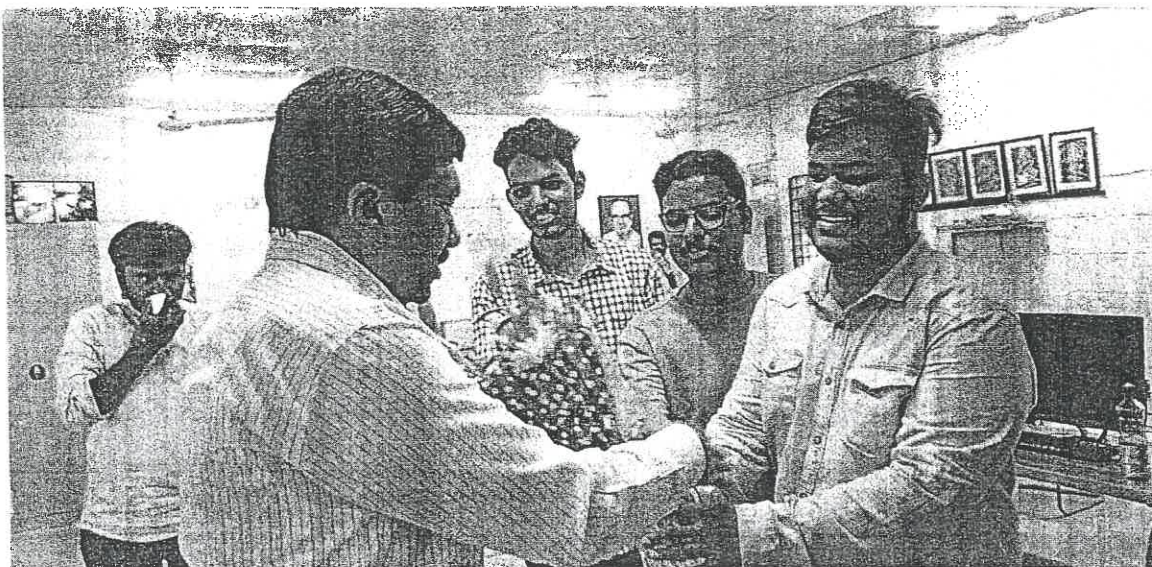
Token of appreciation to HCC-URC team by students.