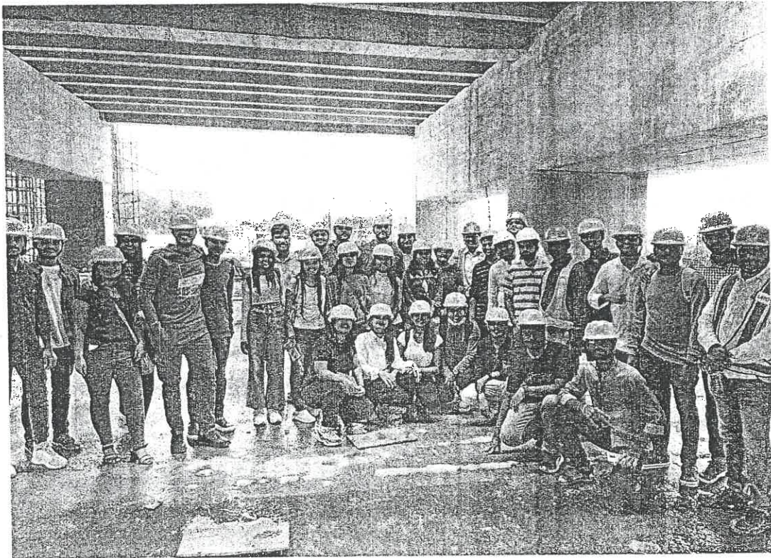
2. At Jayadeva Hospital Junction.