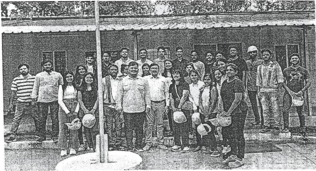
1. At BMRCL Casting Yard, Bannerghatta Road.